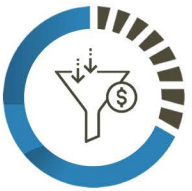
LEAD GEN CAMPAIGNS