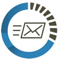
EMAIL MARKETING + AUTOMATION